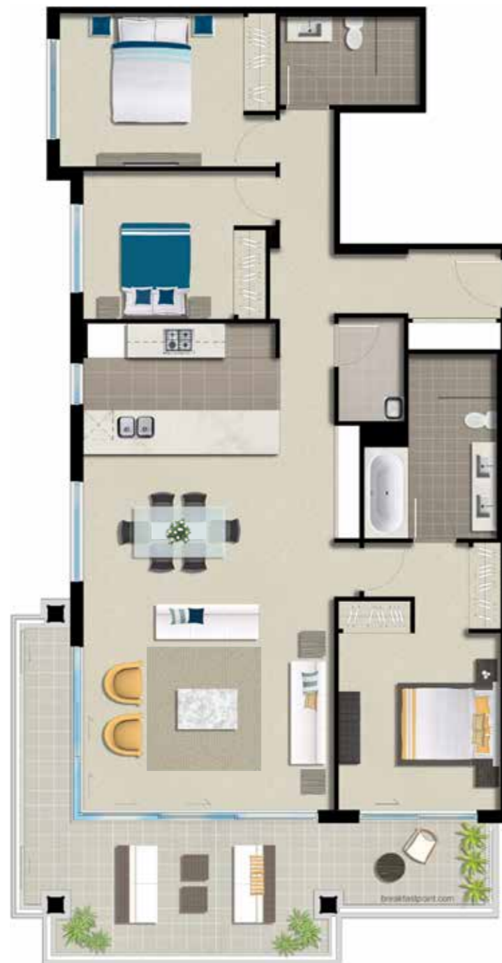
3 bedroom apartment 126sqm plus 24sqm verandah