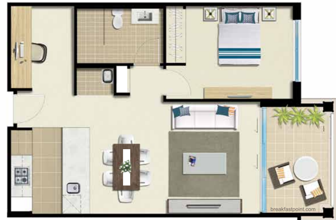
1 bedroom plus study apartment 59sqm plus 6sqm verandah