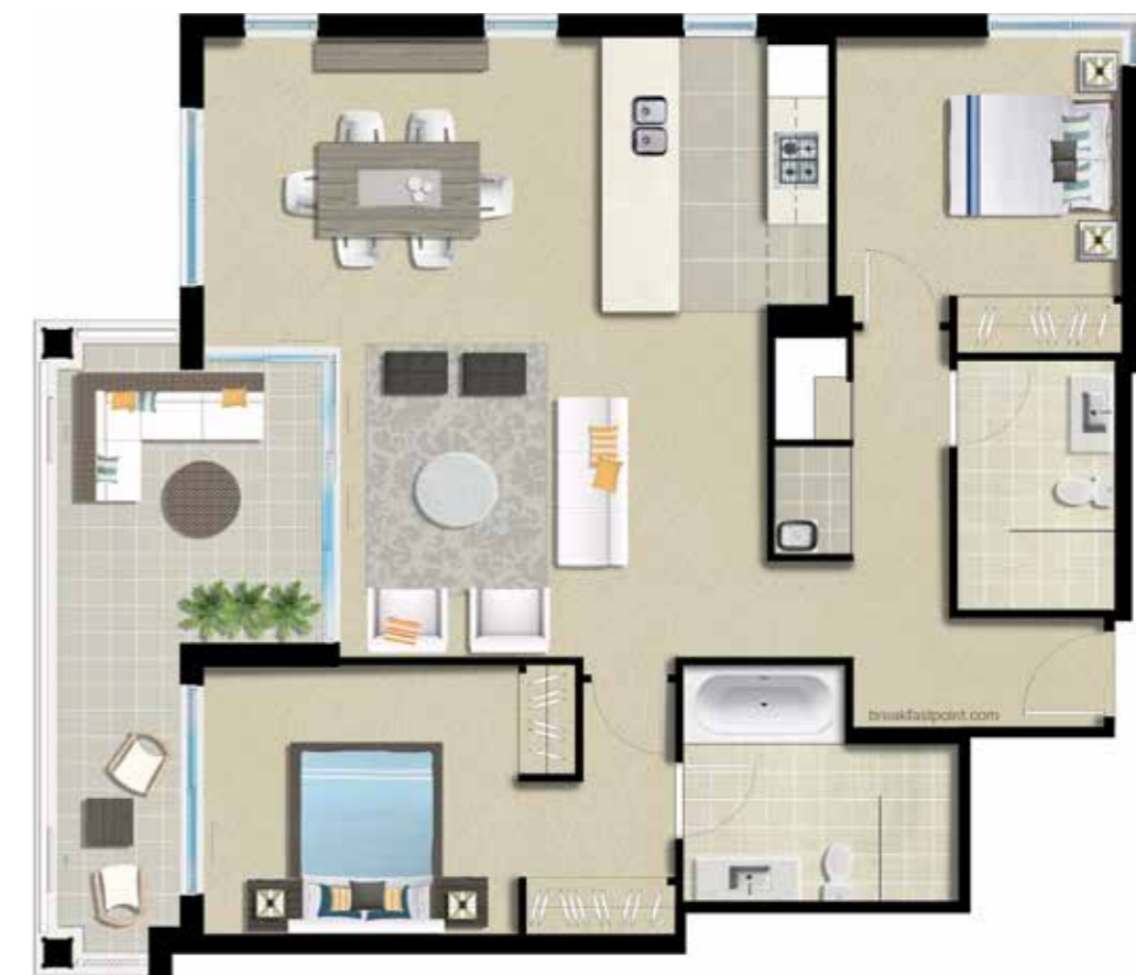
2 bedroom apartment 96sqm plus 14sqm verandah